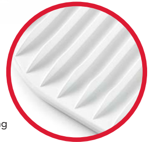
Optional Anti-Spray backing

See overleaf for ordering procedure. Speak to your Truckline Sales Consultant for more information.